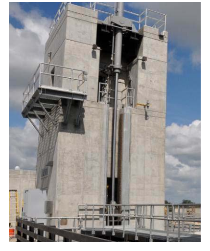
One of four 23' stroke hydraulic cylinders that lift the vertical lift gates

Each cylinder has a dedicated servo manifold that contains a Parker D1FH Servo solenoid valve. Servo control manifolds are located on the HPU in the base of each support tower.