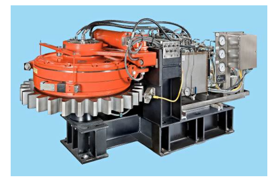
Sector Gate Hydraulic Power Unit with Hägglunds Motor and Drive Gear

One of the larger challenges in previous sector gate systems was ensuring proper seal compression, which is essential for full protection against high storm surges. A design modification for independent hydraulic brake control, along with better control timing and sequences programmed into the control PLC, allows for smoother jogging operations and extremely reliable hydraulic holding at the end of travel during brake re-engagement. Additional functionality is allowed by use of a PLC, such as control of reduced speed near end of travel, overtravel protection, jam or stall detection, redundant pump monitoring and control, and recording of maintenance information for the HPU.