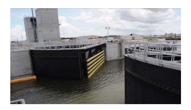
View of Sector Gates in the half open position

The gates were designed to close down water flow in the canal in less than 30 minutes. Gate operation is automated and simple from one of several touch screen controls or operator consoles at the complex. All gates are designed so that they can be moved into closed position with total loss of electrical controls and power in an emergency.