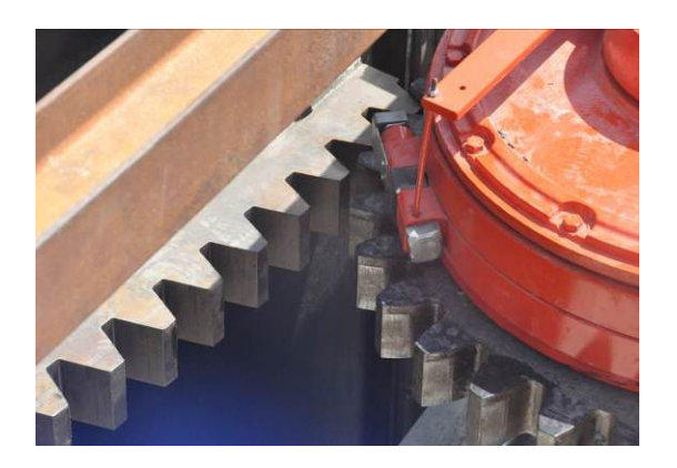
Drive Gear and Rack Gear on Sector Gate

The sequence of operations extends the brake cylinders on the Hägglunds motors to release the brake and allow for motor rotation. Inductive proximity switches count gears and determine position of the gate during motion, including "near open" and "near closed" positions that cause the hydraulic motor speed to ramp down. After end of travel is reached with proper seal compression, the brake is re-engaged.