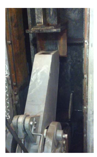
Dogging arm with actuating cylinders as gate is about to come to rest

A key feature of this valve is that it utilizes a fourth spool position to allow free cylinder extension (gate lowering) during a power outage.