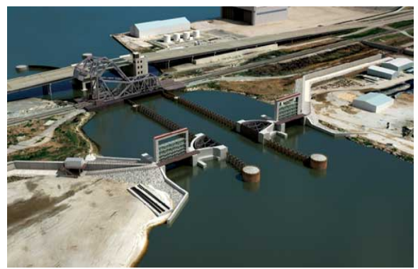
Overhead view of sector and lift gates at Seabrook Gate Complex

The major objective of the project was to work in tandem with the Inner Harbor Navigation Canal Surge Barrier on the Gulf Intercoastal Waterway at Lake Borgne to block storm surge from Lake Borgne and Lake Pontchartrain