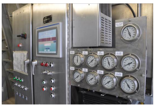
Vertical Lift Gate Hydraulic Power Unit with Control Panel

Every level in the control system contains redundancy for critical functions, from power entry to feedback. The network architecture for the vertical lift gates contains two hot-swappable redundant Allen Bradley