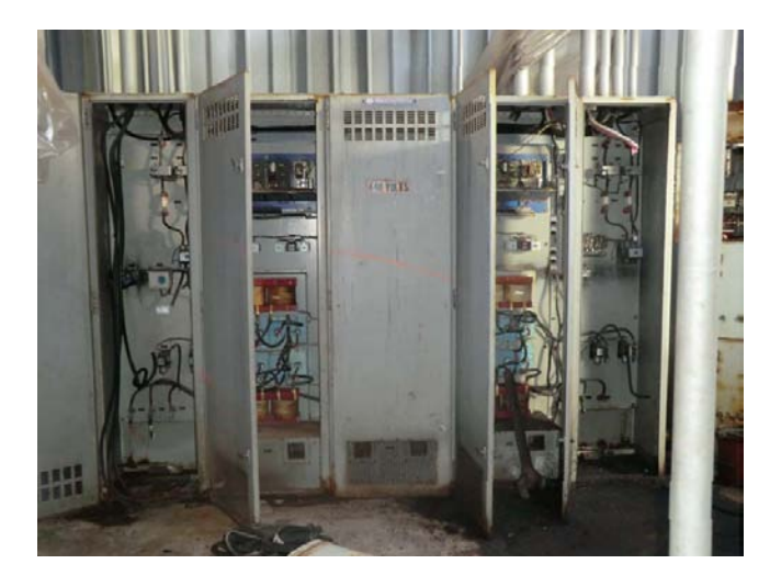
Condition of Motor Generator Set in Bridge Tower

towers at the upper level provided connection between the two towers to allow for operation. The bridge uses a 125 HP AC motor with a 50 HP AC auxiliary motor as the main drive in each machinery room tower. The motors are coupled to the main sheaves through a central planetary gear set and reducers. Mechanical control of the bridge is accomplished through motor brake thrusters located on the main drive shaft from the motor and machinery brake thrusters on each shaft driving the sheaves. Electrical control of the bridge is accomplished through an early generation Programmable Logic Control (PLC) control system. Skew control had been achieved using electro-mechanical Selsyn controller coupled to each motor shaft.