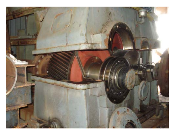
Gear Reducer before Rehabilitation

electrical systems, particularly the motor generator sets, and that much of the connecting wiring was damaged or missing. Portions of the tower machinery rooms' roofs were missing allowing water and pigeons to enter into the machinery rooms. The control system for the bridge located in the bridge house had been vandalized and could not be salvaged. The only access to the tower machinery rooms was via ships ladder since the elevators had been extensively vandalized. All span locks, movable span guides and span buffers were still in place although there condition could not be readily assessed.