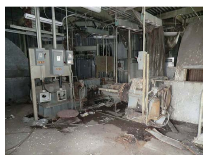
Tower Control Room showing main motor, reducer and main sheave

The C&WI Bridge is a tower drive, two track skewed through truss vertical lift span with a 281'-8" skewed movable span weighing 1.1 million pounds that provides a 125 foot clearance over the Calumet River when in the open position. The two track, four stringer movable span was designed to accommodate a Cooper E80 Railroad loading. There are short approach spans on either side of the movable span to bridge over the poor soils of the river bank. Electrical tie wires strung between the