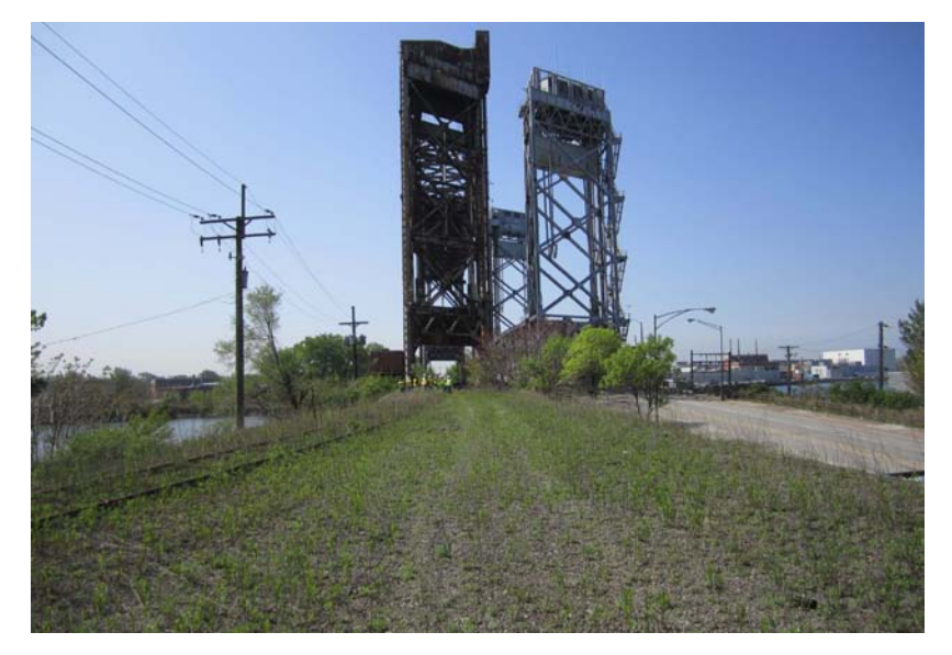
C&WI Bridge (left along abandoned track) and CDOT Torrence Avenue Bridge (right) looking south

The Torrence Avenue Vertical Lift bridge is located immediately north of Ford's Torrence Avenue Assembly Plant. Ford produces a new vehicle every 30 seconds and marshalls their vehicles for shipping in a parking lot north of the bridge. The closure of the Torrence Avenue Vertical Lift Bridge would require Ford to use an eight mile detour to access their marshalling yard. The detour would increase travel time to the marshalling yard from ten minutes to thirty minutes or more depending upon the time of day and traffic conditions. This would create a major logistics problem for Ford