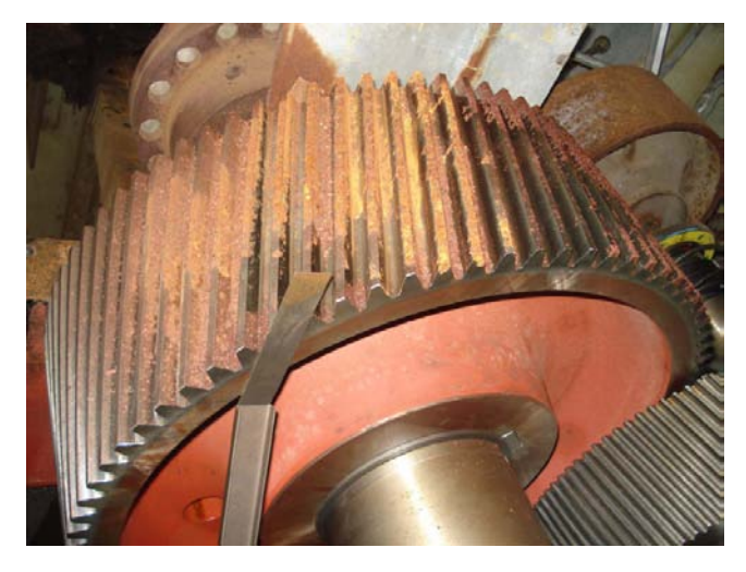
Reducer Gear before Rehabilitation

The mechanical work was relatively simple compared to the electrical work. All gear boxes were opened and drained of oil, inspected